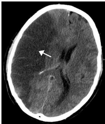
Fig. 3 – Ischemic cerebral lesion.

hsCRP – high sensitivity C-reactive protein; NIHSS – National Institute of Health Stroke Scale.